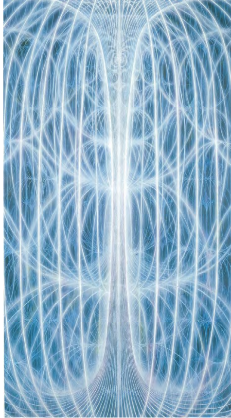
“Universal Mind Lattice“ by Alex Grey, 1981